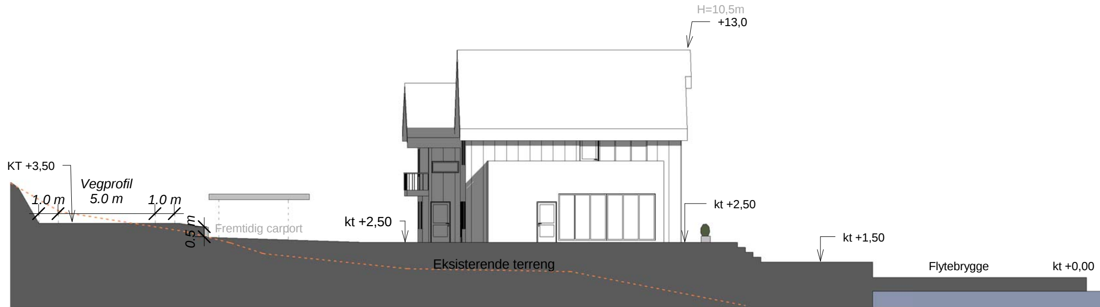
1 Fasadesnitt A 1 : 200