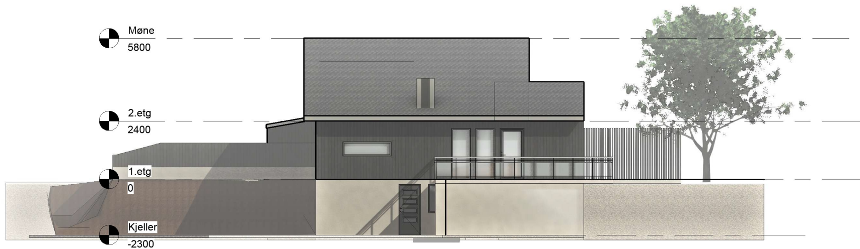
2 Sør Vest 1 : 100