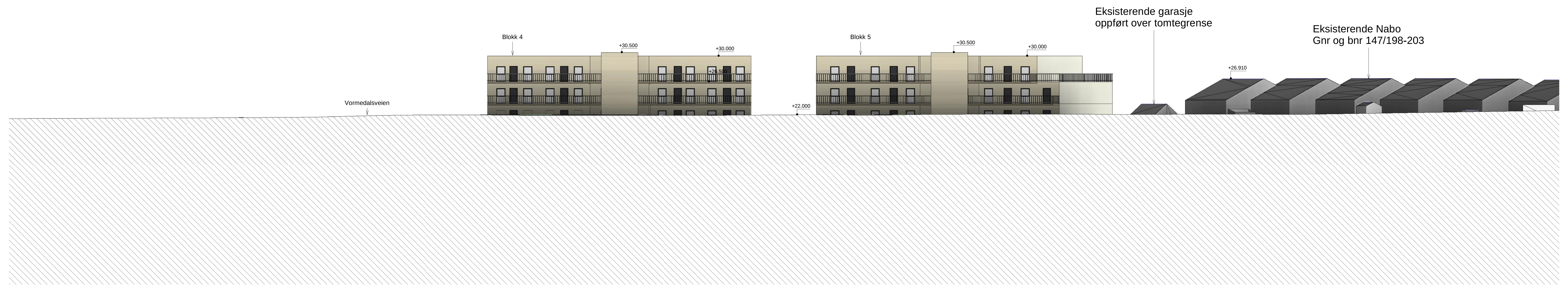
Terrenngnitt 3-3 Sett fra Vormedalsveien 1 : 200